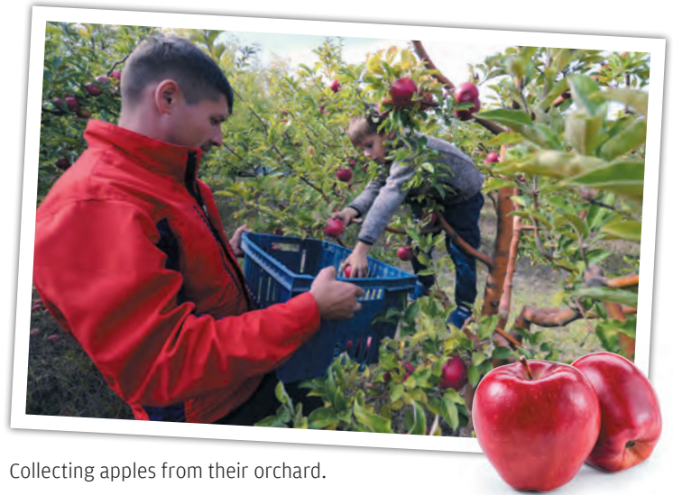
Collecting apples from their orchard.