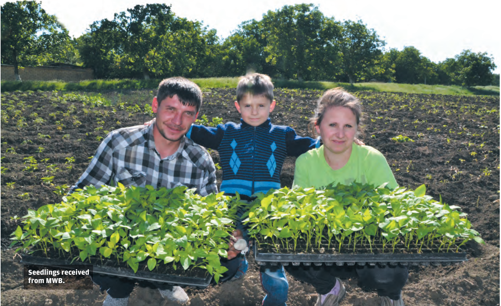
Seedlings received from MWB.