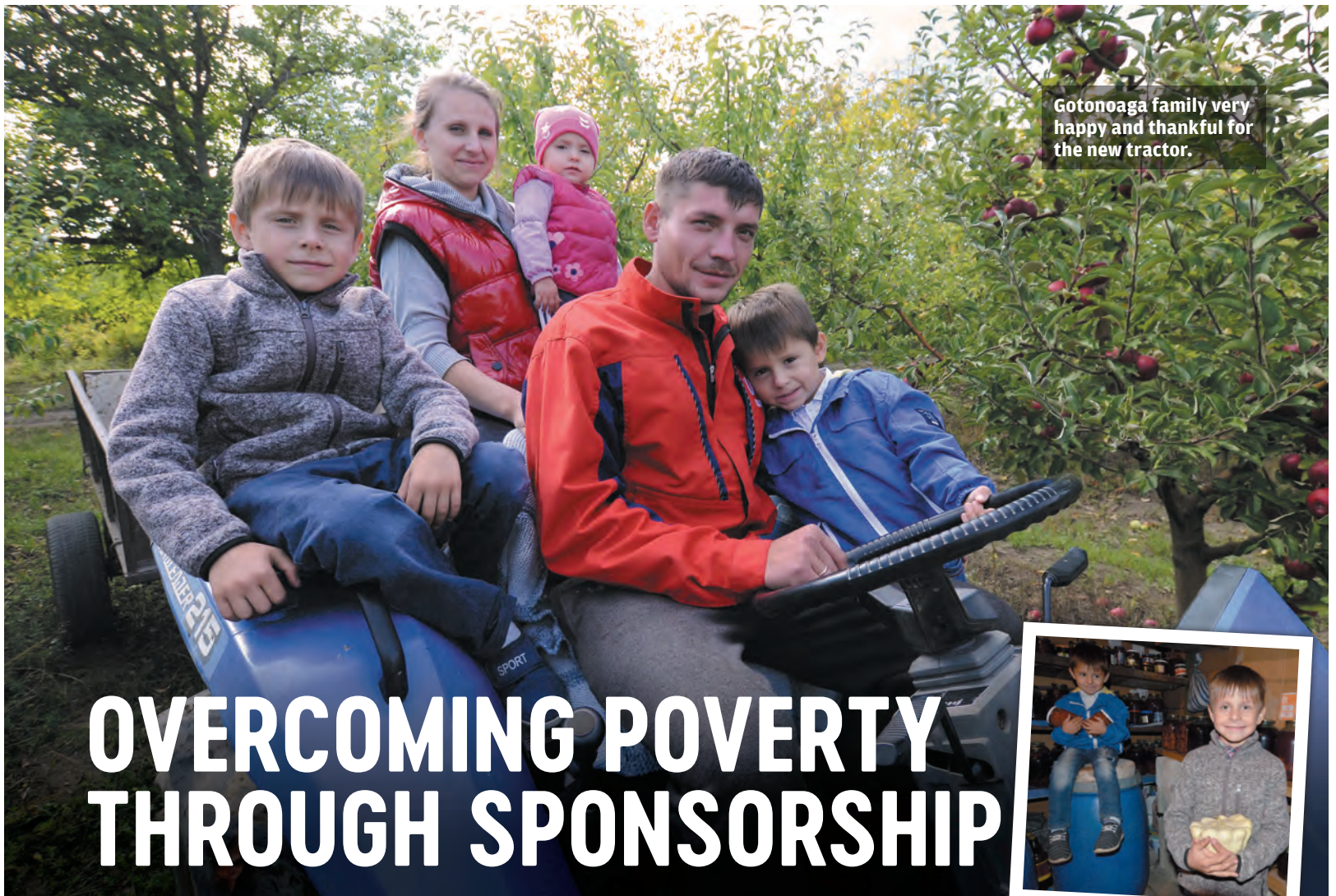
Gotonoaga family very happy and thankful for the new tractor.