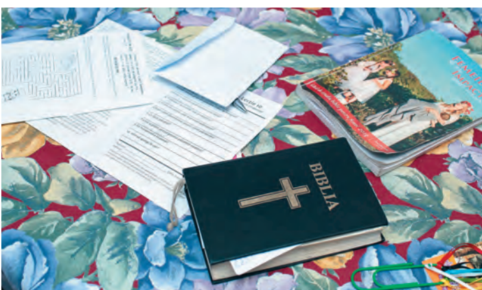
BCC Bible Study.